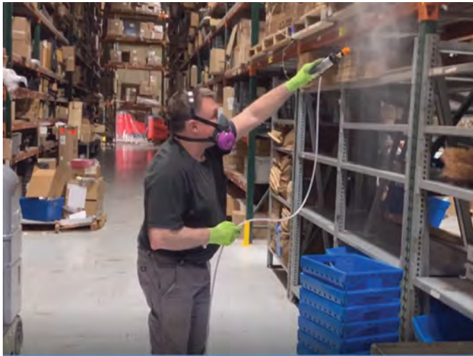
Easily sprays disinfectant solution via 25 foot hose.